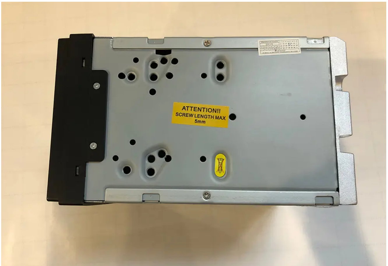
Installation In 2002 – 2005 Mercedes CLK320