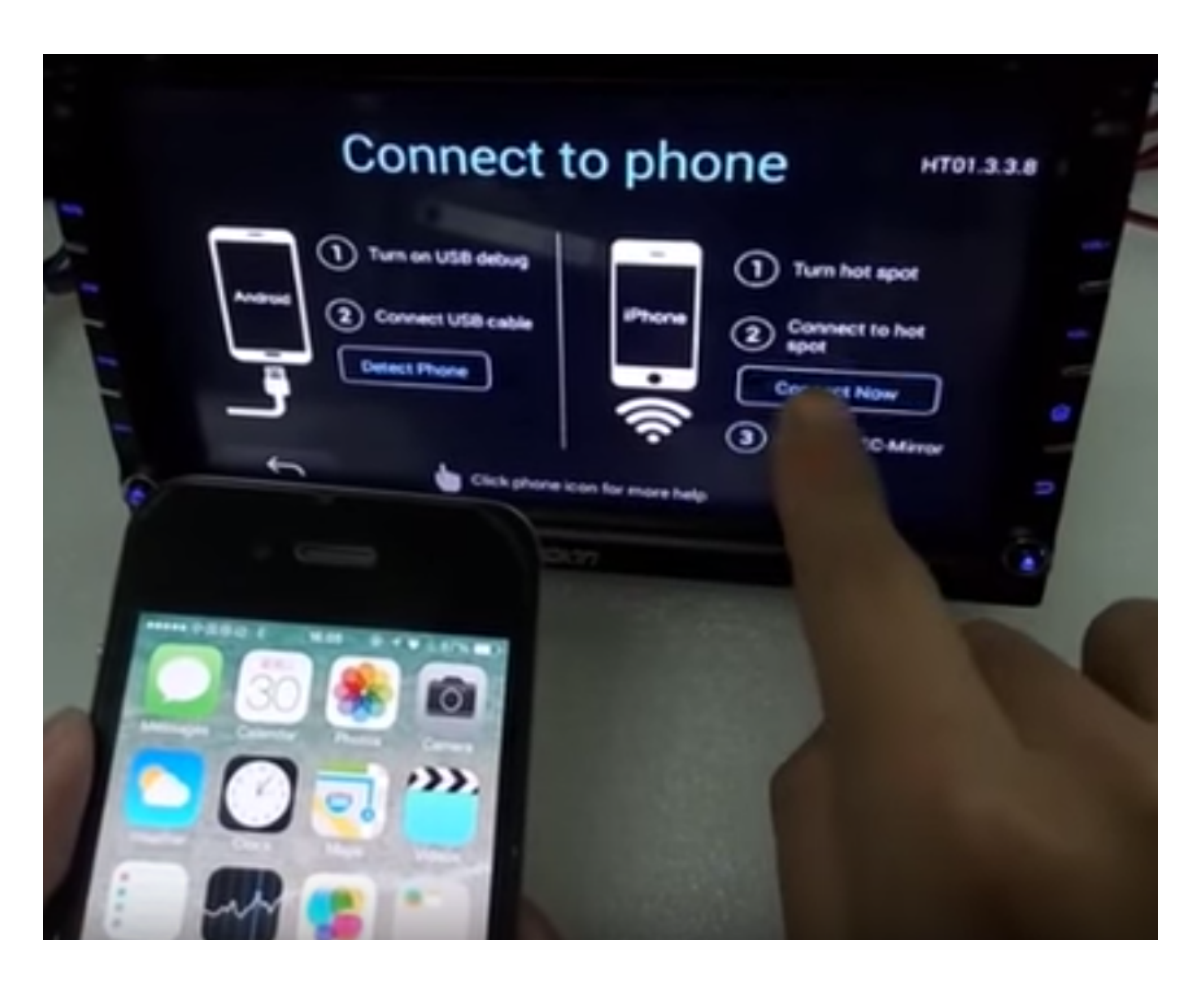
Method 1 : Using the iPhone's hotspot

MirrorLink is a protocol that devices like your smartphone and in-dash car stereo can use to communicate. It's invented by the Car Connectivity Consortium (CCC) which established in 2011. The protocol formerly known as Terminal Mode. If you've ever cursed your car for not doing all the cool stuff your iPhone can do, MirrorLink will save your poor car's feelings from your terrible wrath. Here are the methods for iPhone user to get MirrorLink work on the Pumpkin Android 4.4 head unit: