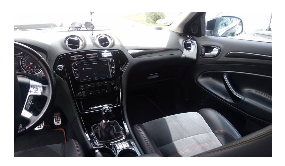
Play music from my USB flash.