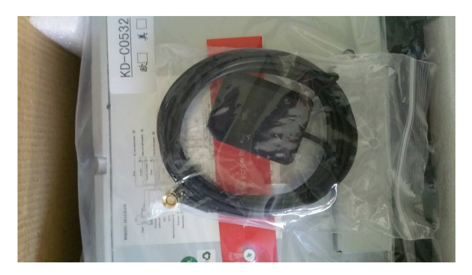
The car stereo itself.