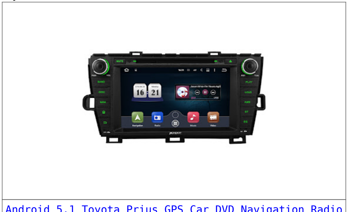
Android 5.1 Toyota Prius GPS Car DVD Navigation Radio

Today we introduce another new <a href="Pumpkin">Pumpkin</a> <a href="Android 5.1">Android 5.1</a> <a href="Car DVD">Car DVD</a> <a href="GPS">GPS</a> for Toyota Prius.