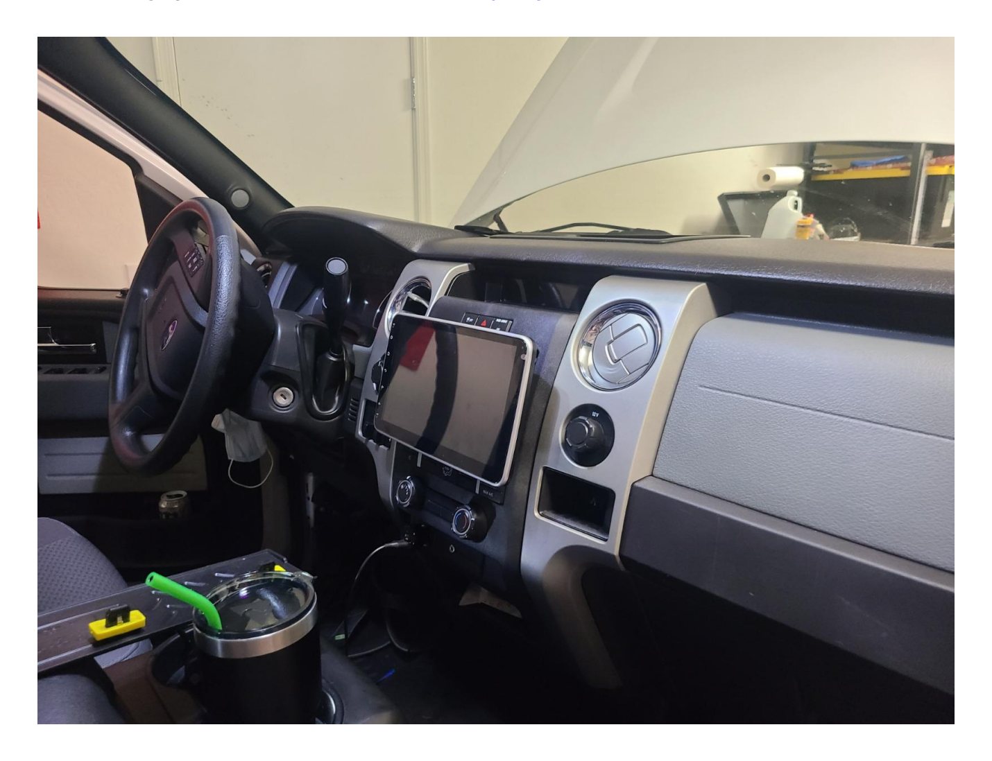
Step No. 2: Mirror-Link Compatible Phone or Tablet Having Android 7 & 8

The first thing you require in a car multimedia is its mirror-like compatibility. With very little effort, you will be able to watch Netflix on the type of head units that can be mirrored. However, you will require a few cables and other connectivity devices. If you are a professional in linking devices, you will be able to activate Netflix hassle-free in your car. All you need to do is appropriate settings by mirroring your device with the player.