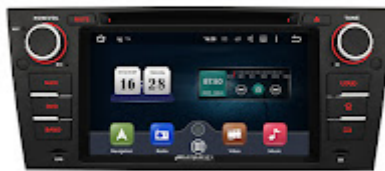
Android 5.1 Car GPS Radio for BMW E90