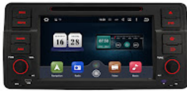
Android 5.1 Car GPS Stereo for BMW E46