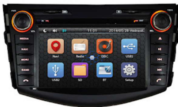
Wince 6.0 GPS for Toyota RAV4

Brief Introduction of this car dvd system: