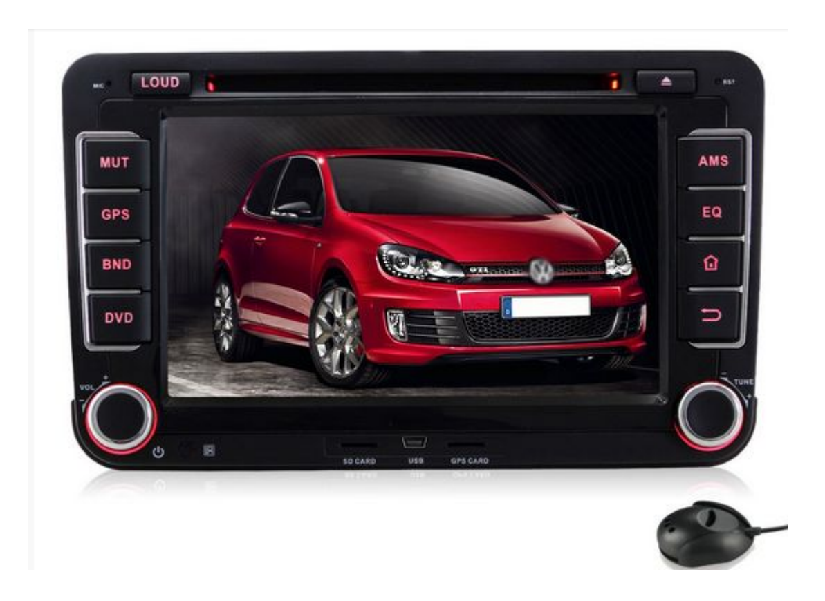
Step 1 : Purchase an aftermarket <u>Bluetooth car stereo</u>. Stock head units of newer car models already have Bluetooth capability. But if your car is a bit older, you can purchase these kinds of car radios for at least a hundred dollars from your local car parts store or the online store.

Step 2: Install the head unit. Aftermarket car stereos with B luetooth capability are designed just like any other head unit s. To install, simply remove your current car radio and discon nect all the wires behind it. Then, following the same wiring diagram or what is instructed in your new head unit's manual, connect the wires to the new radio and slide it back to the he ad unit bay.