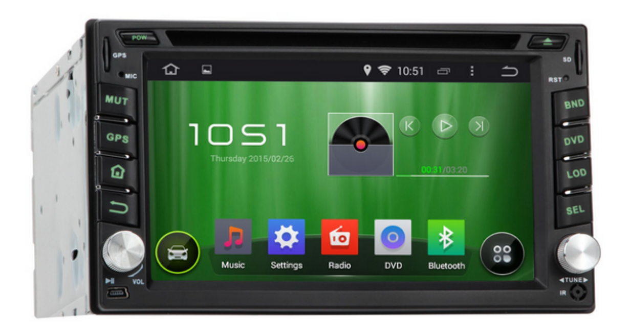
Universal Android 4.4 Car Stereo KD-C0223