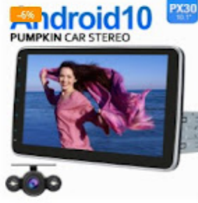
1DIN UNIVERSAL-AA0552B+Y0801 Pumpkin Android 10 Single Din 10.1 Inch Touch Screen Head Unit With Backup Camera $309.99 $289.99 ★★★★★