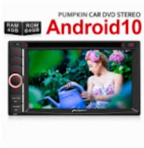
UNIVERSAL-AA0525B Pumpkin 6.2 Inch Double Din Touch Screen Android 10 Universal Car Stereo Radio With 4GB RAM 64GB... $339.99 ★★★★★