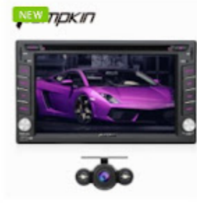
UNIVERSAL-AB0114B+Y0801 Pumpkin Double Din Car Stereo GPS With Backup Camera DVD Player (6.2 Inch Universal Style) $179.99 ★★★★★