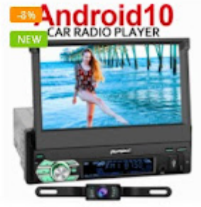
1DIN UNIVERSAL-AA0553B+Y0811 Pumpkin Android 10 One Din Car Radio With 7" Flip Down Screen And Reverse Camera (2GB+32GB) $339.99 $309.99 ★★★★★