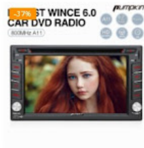
UNIVERSAL-AB0114B Pumpkin Radio 6.2 Inch 2 Din Car Stereo For Universal Car Model With DVD Player Bluetooth GPS... $269.99 $169.99 ★★★★★