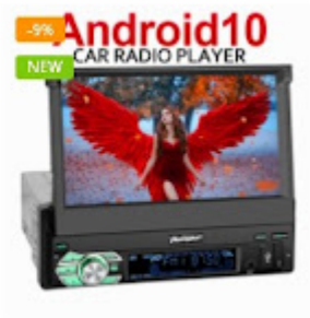
1DIN UNIVERSAL-AA0553B Pumpkin 7" Android 10 Single Din Flip Out Touch Screen Car Stereo With Sat Nav Bluetooth(2GB+32GB) $329.99 $299.99 ★★★★★