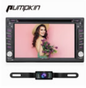
UNIVERSAL-AB0114B+Y0811 Pumpkin 6.2 Inch 2 DIN Universal Car Stereo With Backup Camera, DVD Player $179.99 ★★★★★