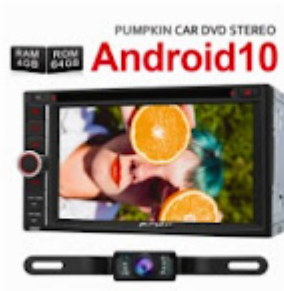
UNIVERSAL-AA0525B Pumpkin 6.2" Double Din Touch Screen Android 10 Head Unit With DVD Player Camera $349.99 ★★★★★