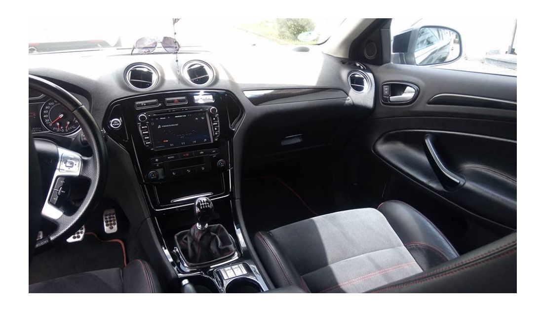
Play music from my USB flash.