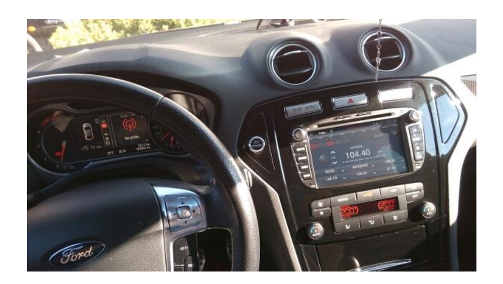
AV-IN for Reverse Camera