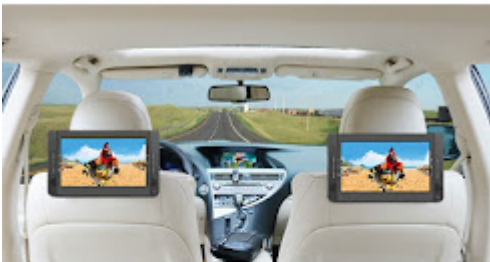
WATCH 2 DIFFERENT DVDS