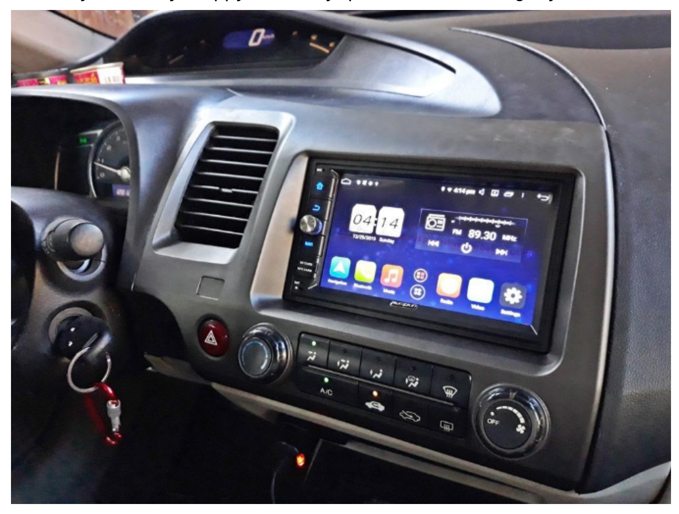
it out yet. Very happy with my purchase and highly recommend!